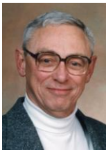
Kinsman, William Charles (1936 – April 15, 2010)

No Photo available: Gero, Fred March 25, 2010