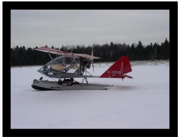
Chinook (Equipped for water and land takeoff & landing)

The second machine we purchased is called a Chinook Plus2. It came partially as a kit, the rest we built ourselves. It is amphibious and we use it all year round. An Ultralight license is all that is necessary to fly this machine although a higher level license is recommended. The license I obtained is called a Recreational Pilot Permit. I obtained it through the Smiths Falls Flying Club, which is one of the least