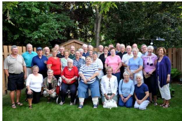
Class of '49 in August 2011