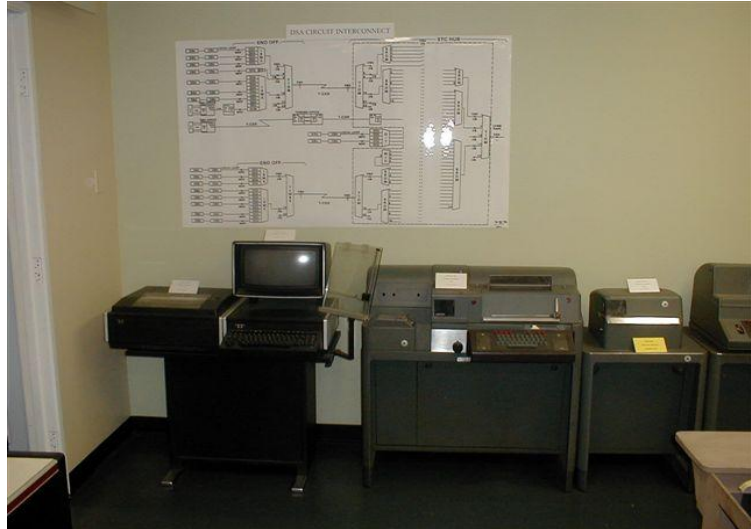
The beginning of the end for the CM group