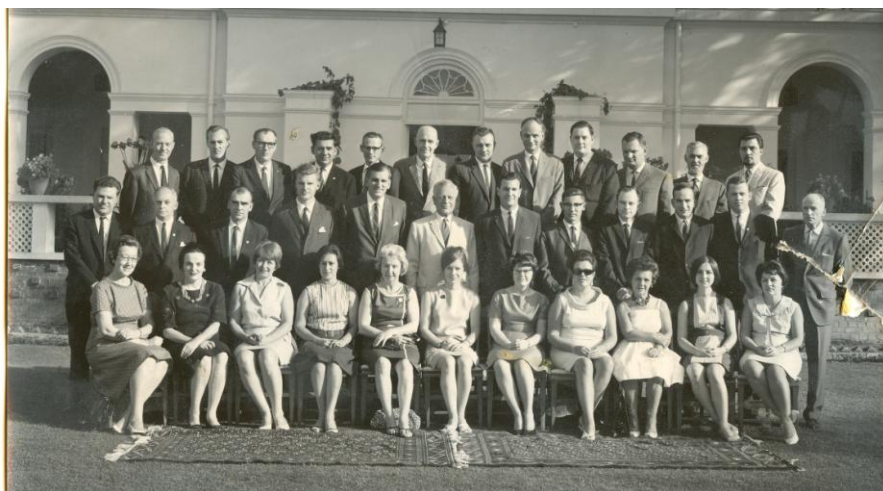
Staff in New Delhi – April 7, 1967 - names below

But my immediate problem was getting from Montreal to Ottawa. Not to worry. I was met at the aircraft by a truck and two RCMP cruisers which formed a convoy from Montreal right to the East Block in Ottawa.